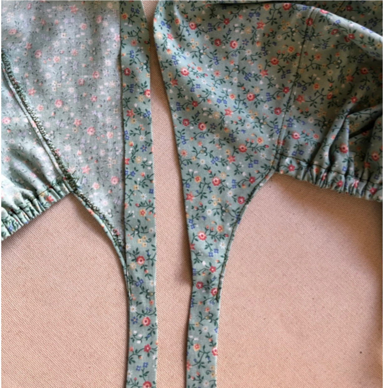
Zigzag across the top of the front band.